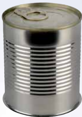
3-piece food cans