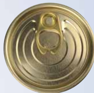
Easy open ends